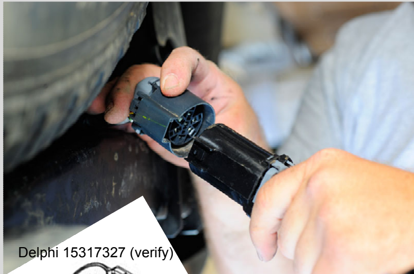
Delphi 15317327 (verify)

When connecting to a truck with Body Control Module (BCM) that requires an electrical load equivalent to at least two (2) bulb filaments: